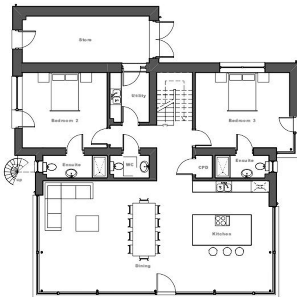
Ground Floor Plan 1:100 @ A1